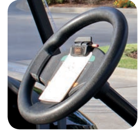
Comfort Grip Steering Wheel