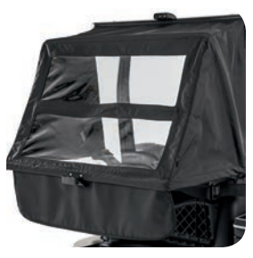
Bag Cover with Magnetic Latch