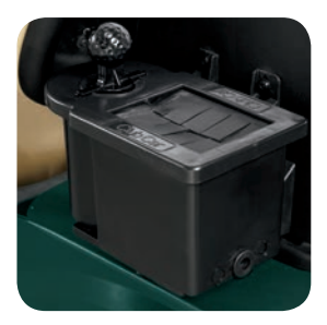
Ball and Club Cleaner