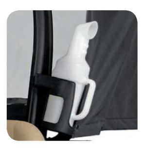
Divot Repair Sand Bottle