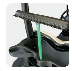
Sand Trap Rake Kit